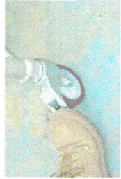
MOVE INTO PLACE AND LOCK ALL CASTORS