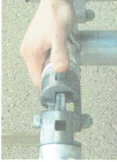
OPEN UNIT UNTIL BACK FRAME LOCKS IN PLACE