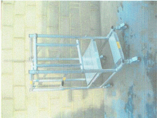
CARRY OR WHEEL UNIT TO SITE