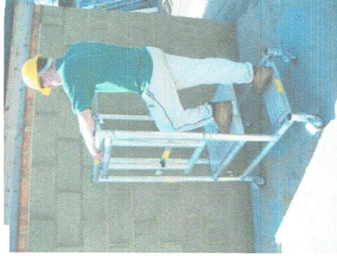
RELEASE GATE, SWING ROUND AND LOCK BEHIND YOU ON THE VERTICAL BEFORE USE.