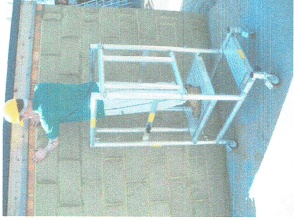
DO NOT OVERREACH WHEN USING UNIT, SEE OVERLEAF FOR SAFETY NOTES