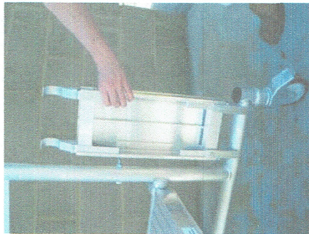
LOWER STEP INTO PLACE